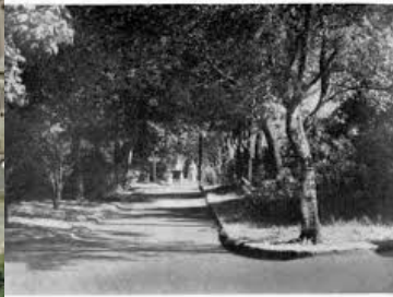
wooded walk in Willow Park